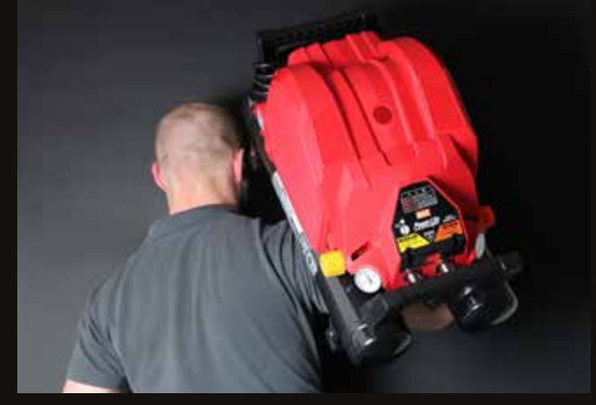
Thanks to the aluminum tank, it has ultra-light weight with high durability.